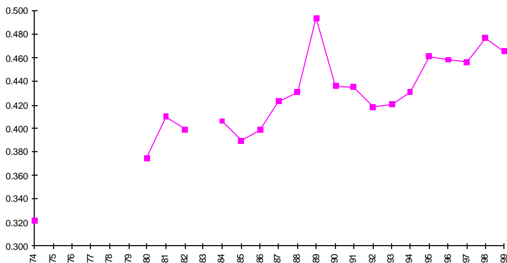
Figure 3.1 Gini coefficient. Equivalent household income distribution Greater Buenos Aires, 1974-1999

Source: Author's calculations based on the EPH. October waves.